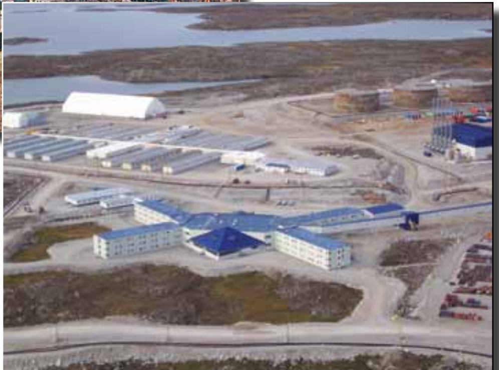
Example of a Residential Camp